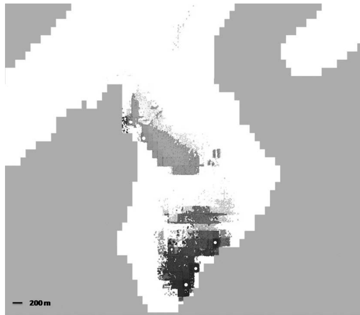
FIGURE 3: Final spatial distribution of our 16-days simulation. Darker particles represent the results from the default simulation, while grayscale particles symbolize particle dispersion from the sensitivity scenarios. White circles shows each cage location.